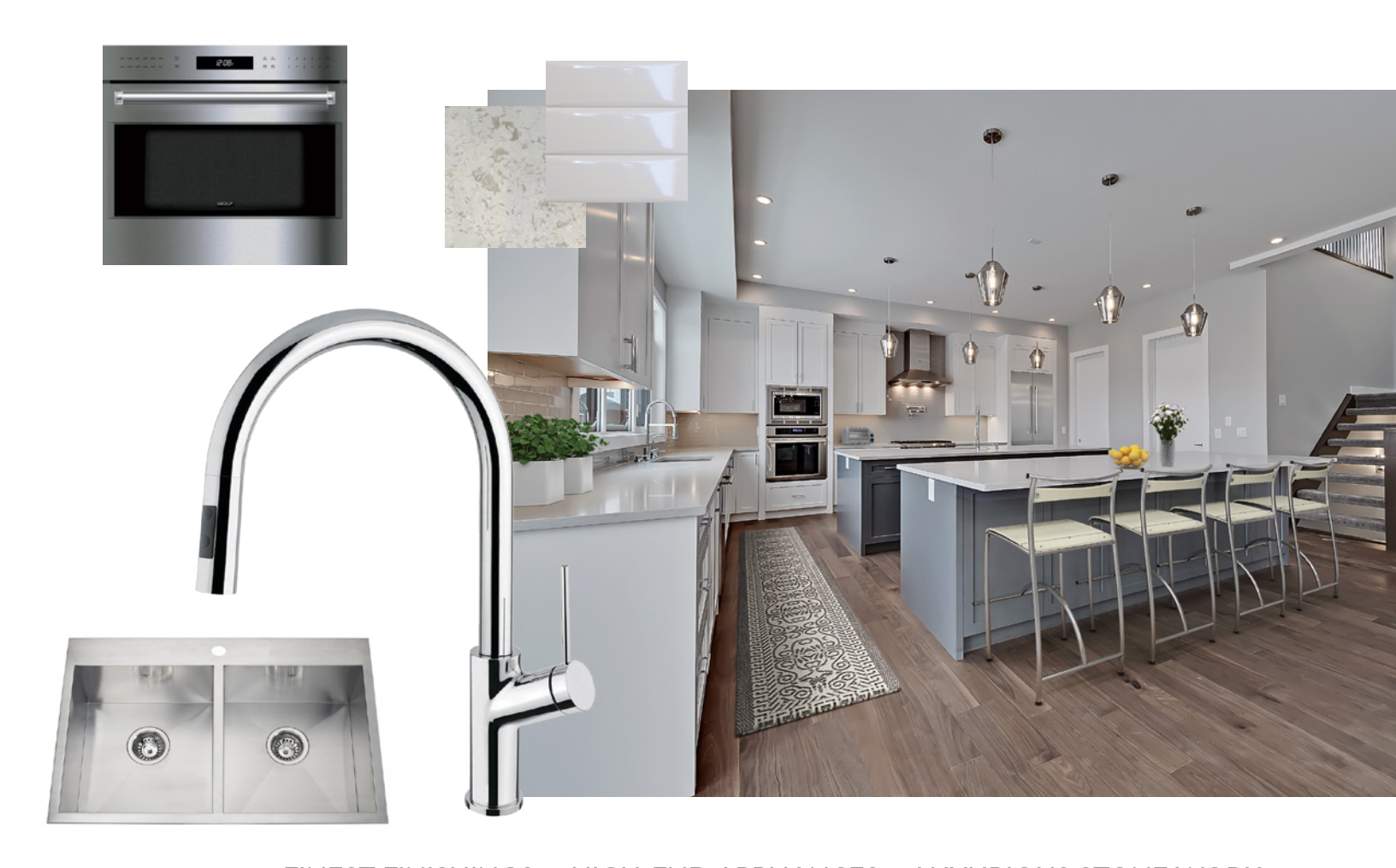
FINEST FINISHINGS • HIGH-END APPLIANCES • LUXURIOUS STONE WORK